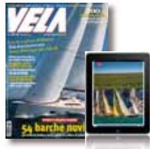
Giornale della Vela