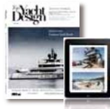
Top Yacht Design